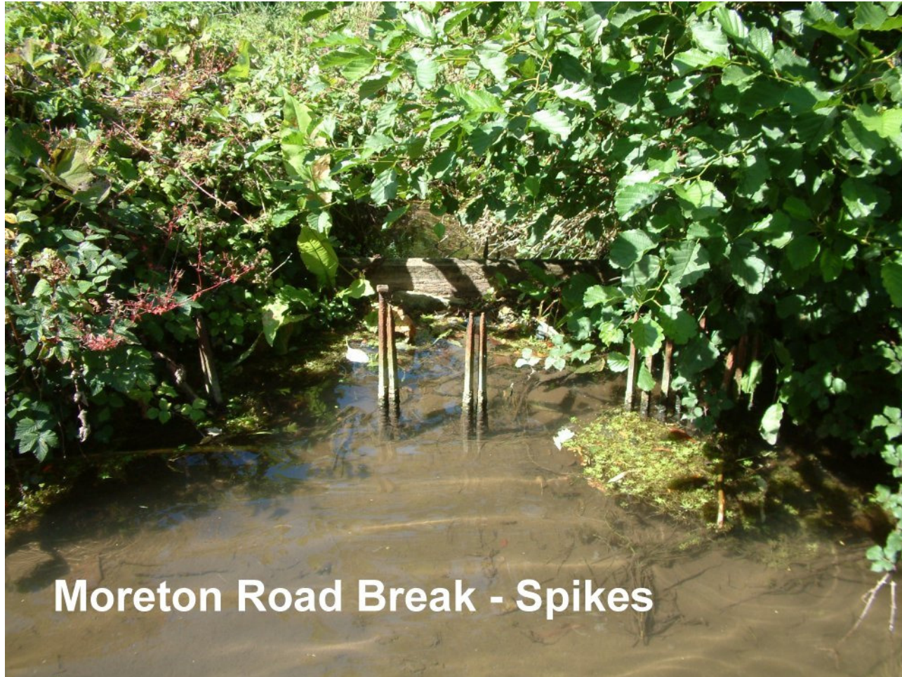
Moreton Road Break - Spikes